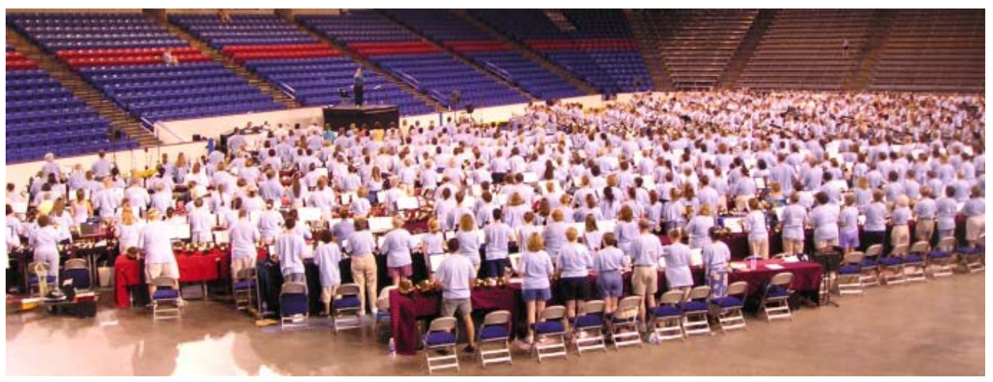
Massed rehearsal on T-shirt day