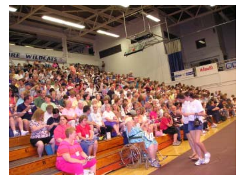
Waiting for the opening concert