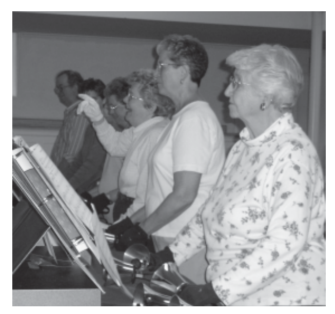
Some of the participants at the workshop.