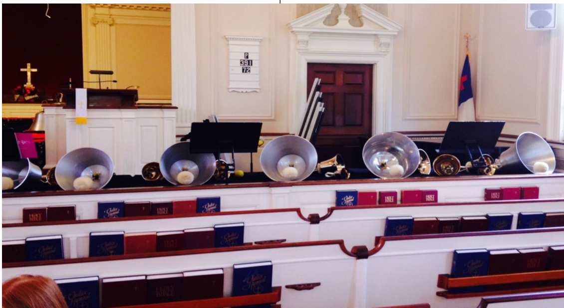
Portion of the 8 octave Westminster Concert Bell Choir handbells.