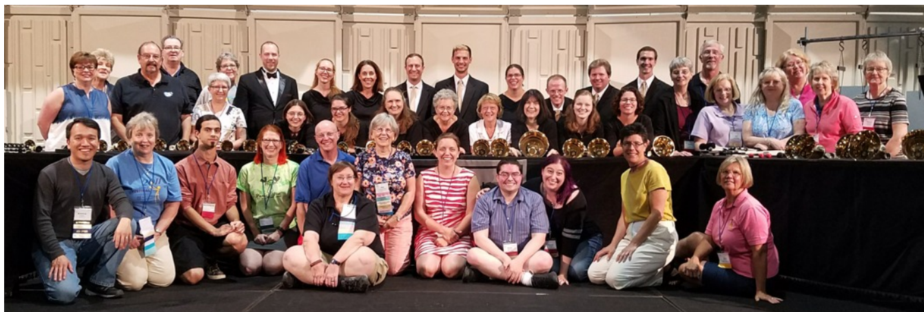
Area 1 at National Seminar.