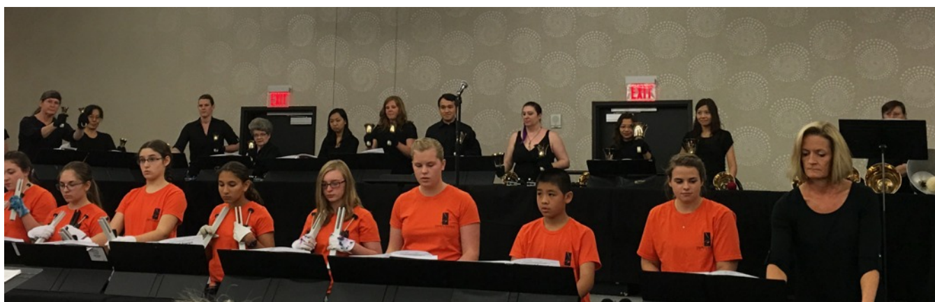
Distinctly Teen Choir