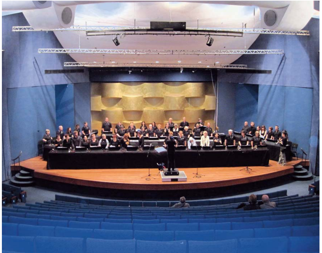
Rehearsal at the Tel Aviv Art Museum.